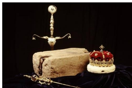
The Throne of Scone