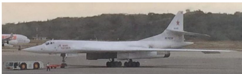
TU160 Nuclear Bomber

Passing through Caracas Simon Bolivar airport on the 11 th December 2018, from the observation lounge I took a photo of a pair of these Russian aircraft landing –