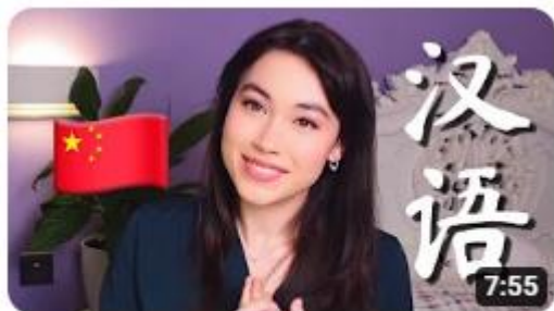
Why Learning Chinese in 2023 Gives You The Advantage

The final appendices of dossier Anunnaki Conquest C details injuries sustained following Federal Police selling my body for medical experimentation to the Roman Catholic Church. Distressingly the shrinkage caused to my brain deteriorated last year and I have been forced to cease cold water surfing. This last winter, thanks to the internet and YouTube algorithms feeding me knowledge while a Russian owned hostel kept me warm, I have commenced use of traditional Chinese remedy Lion's Mane in hope of this special fungi performing neurogenesis.