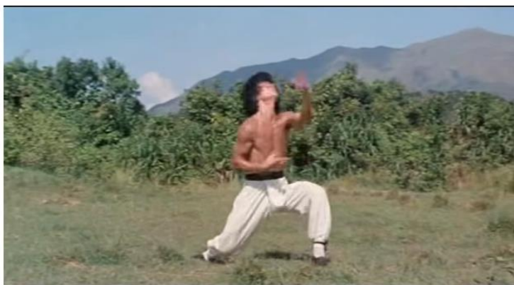
8 Drunk Gods - Drunken Master - Original re Dub

https://www.youtube.com/watch?v=2CtAHLGIRbI