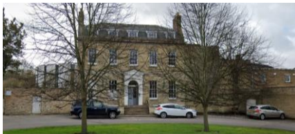
20 High Street Huntingdon

For the first time since commencing presentation to your predecessor in June 2019 I am relying on a House of Commons address, my previous deliveries were made to the Huntingdon Conservative Association office at Centenary House, St Mary's Street Huntingdon. In June of this year I found this building to have been closed and boarded up so made delivery to 20 High Street believing this to be constituency address for Jonathon Djangoly as his recorded constituency address on the Stukeley Road did not exist.