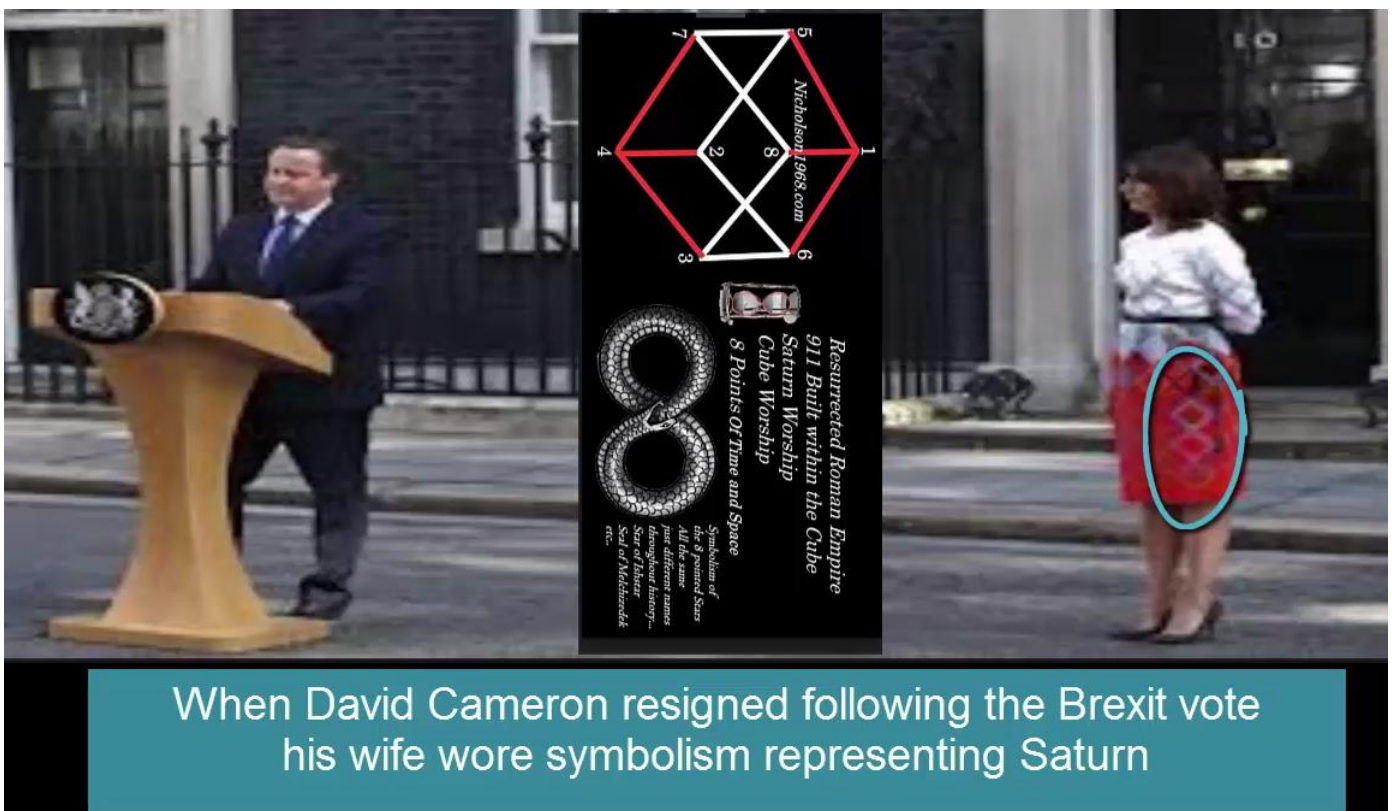
When David Cameron resigned following the Brexit vote his wife wore symbolism representing Saturn

My first letter to you of June 2019 requested permission for using the image below of your wife Samantha in video 'The Whore of Babylon or Bob and Rocky part 1'- enclosed CD Rom folder <ApollobathTV/Oculus Dei>